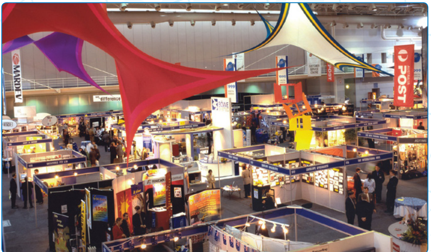
Exhibition hall view

Half page (mono) $300 Bookings close: 21 August 2009