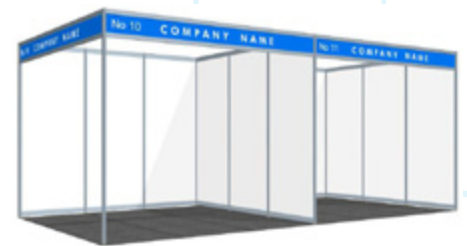
Diagram of a single or double 3m x 3m shell scheme booth package

Additional furniture, including computer hire, may be arranged through the Conference Managers, at an additional charge.