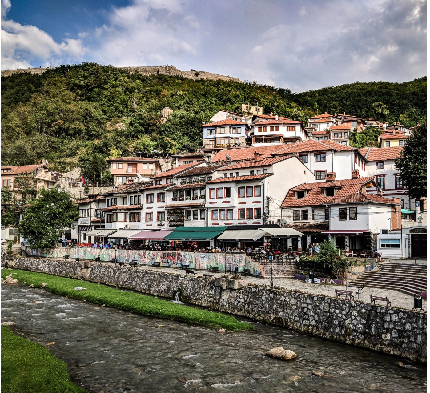
Fitore Sylva, CC BY-SA 4.0, via Wikimedia Commons