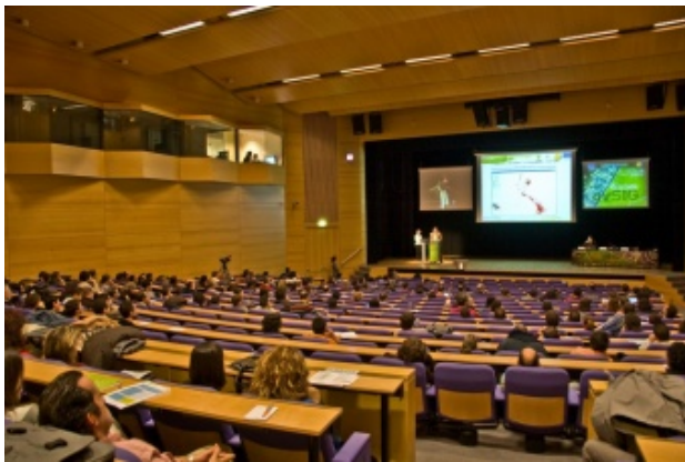
Figure 3: Session