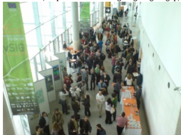
Figure 1: Conference Hall

Aiming to produce reusable components not only for gvSIG software but also for other Java FOSS projects, gvSIG project is releasing some products as independent sub-projects at the gvSIG Commons initiative. At this moment the Open Scene Graph Virtual Planets project is releasing versions and is published also at the SVN ( http://subversion.gvsig.org/osgvp )