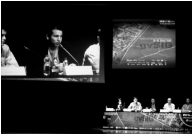
Figure 2: Session

There were 9 workshops to show last gvSIG features as well as more than 30 presentations and plenary sessions.