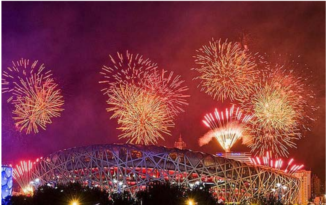
Fig.2 Olympic Opening Celebration in Beijing 2008

FOSS4G conference venue will take use of the facilities located at Beijing international conference center. Conference center sets inside the Olympic park, it will provide smooth, easy and rewarding conference planning process from start to finish. For a large conference hall (with 500-800seats) will cost about 36000RMB (around 5000$) for half a day. And the largest conference hall could contain about 1500 audience maximum.