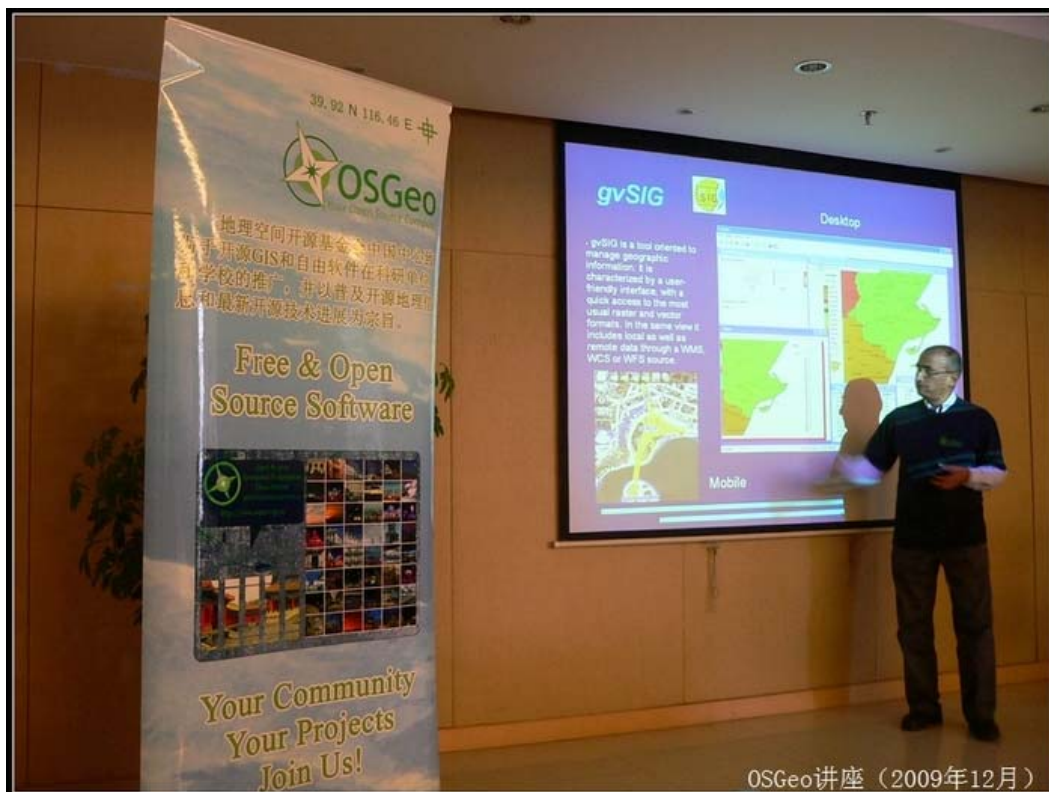
Fig.6 OSGeo China Lecture