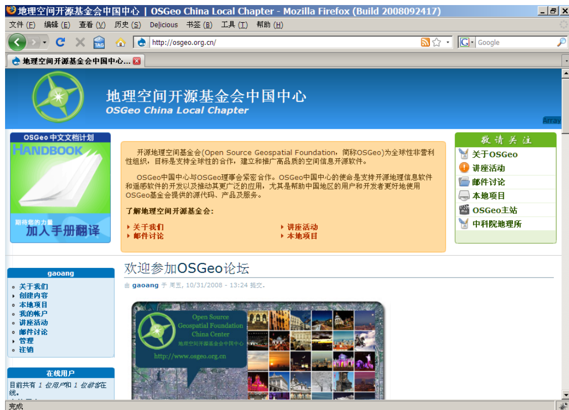
Fig.1 OSGeo China Local Chapter Website