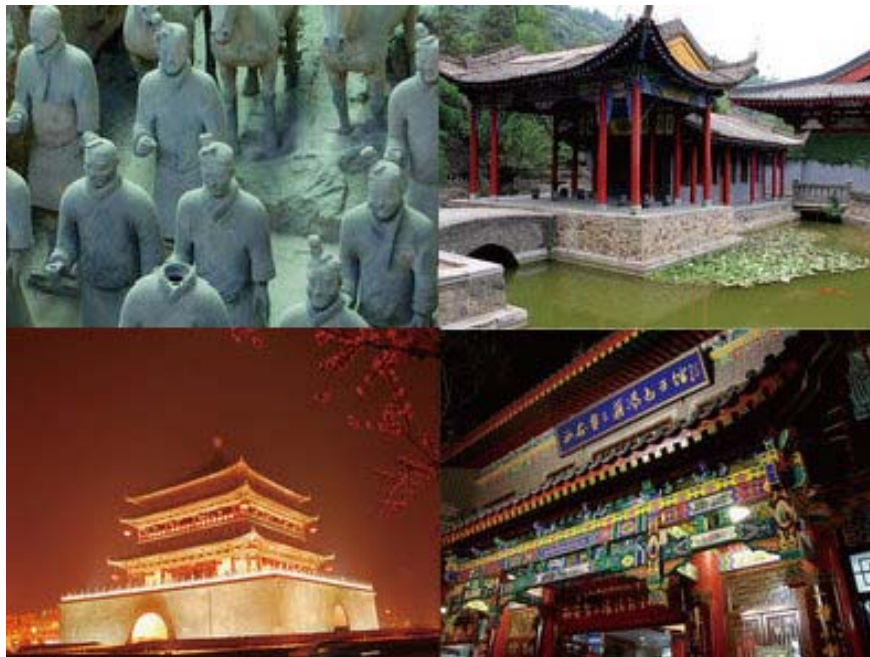
Fig.8 the places of interests of Xi'an China

Besides the tourism, we will also organize a middle size meeting with local GIS companies in Xi'an which interested in Open Source Geospatial Software. The meeting would last for a half day and at the same time; we provide an opportunity to all the attendants to introduce their own GIS products and new technologies to the local companies.