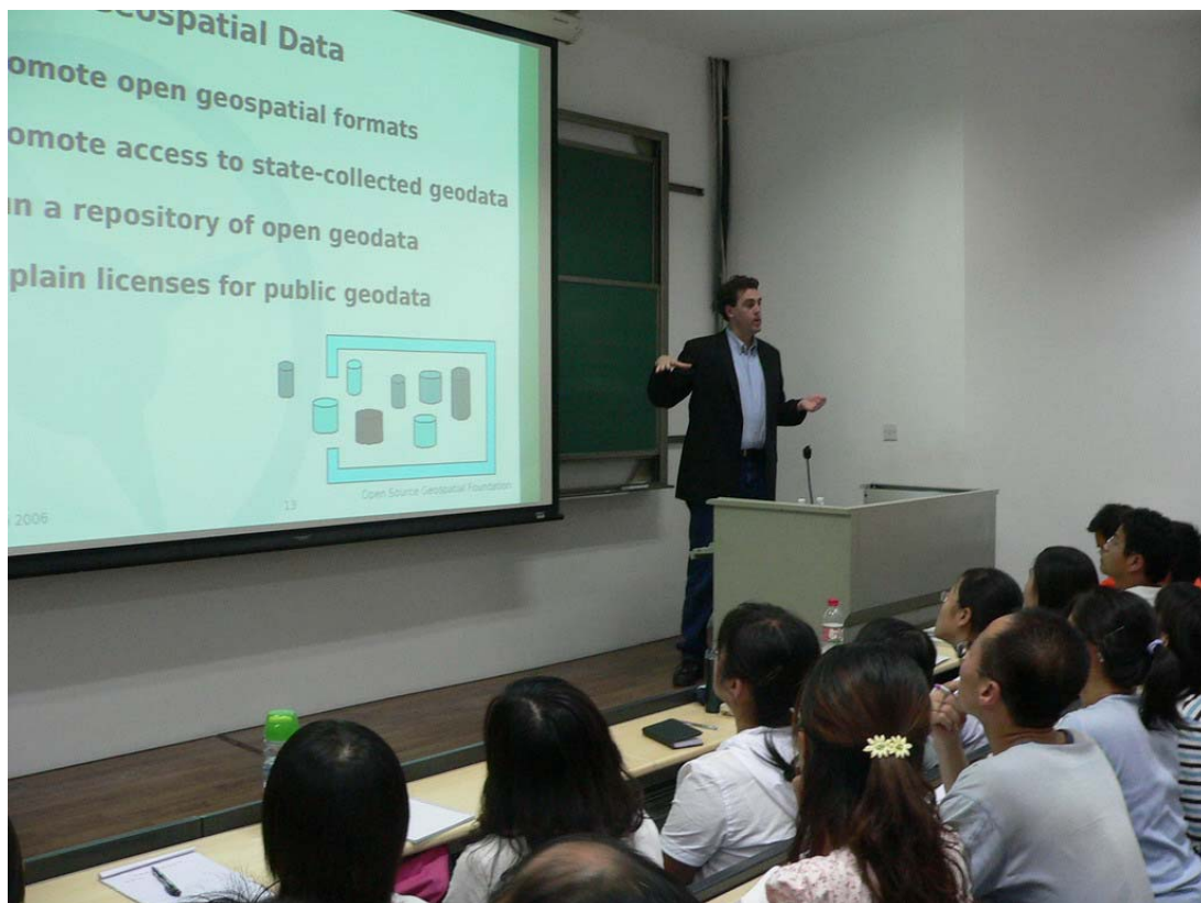
Fig.4 OSGeo delivers a speech for Chinese students

More and more open source communities from China pay lots of attention on GIS development. FOSS4G in China will also get support from local open source communities.