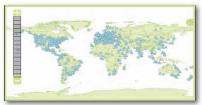
Figure 1: QGIS Community Map